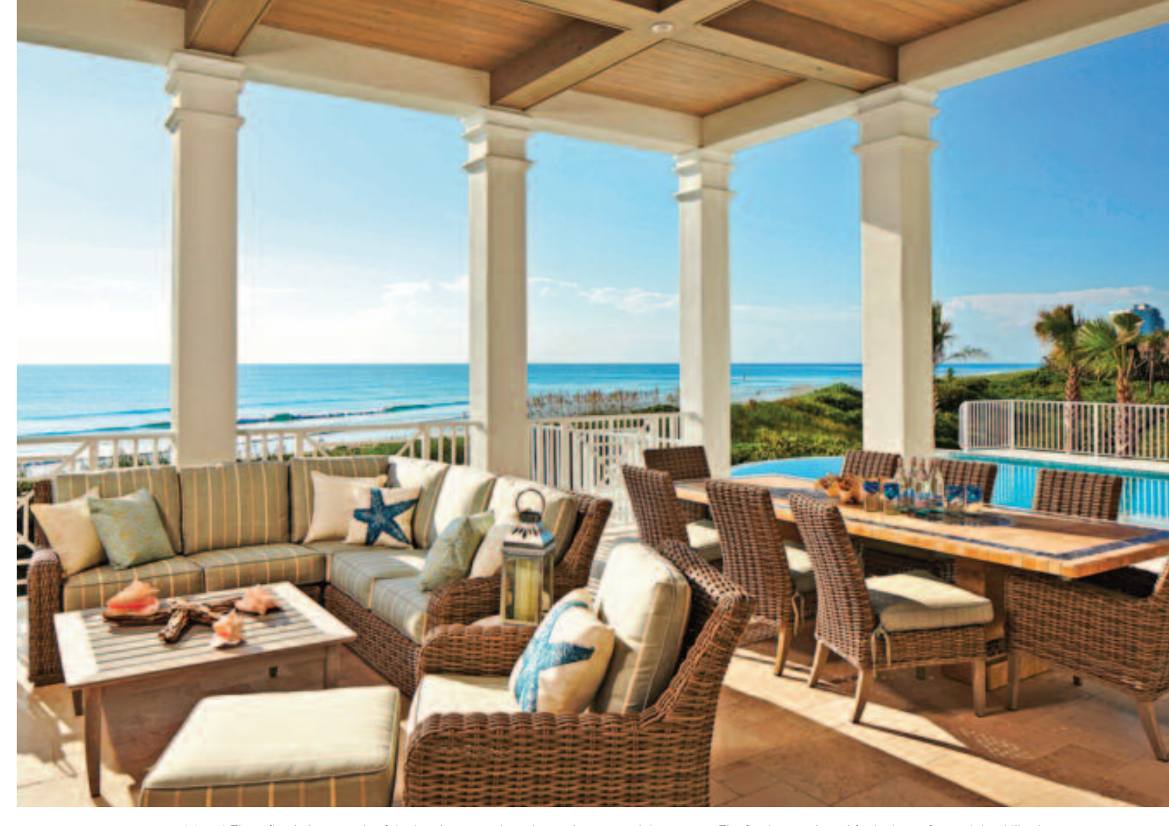
(above) The refined elegant style of the interiors extends to the outdoor entertaining spaces. The furniture, selected for both comfort and durability, is crafted from a high-end woven vinyl to mimic the style of natural wicker and finished in a shade similar to driftwood to reflect the shades of the dunes. A custom stone and mosaic tile tabletop was crafted for the summer kitchen space.