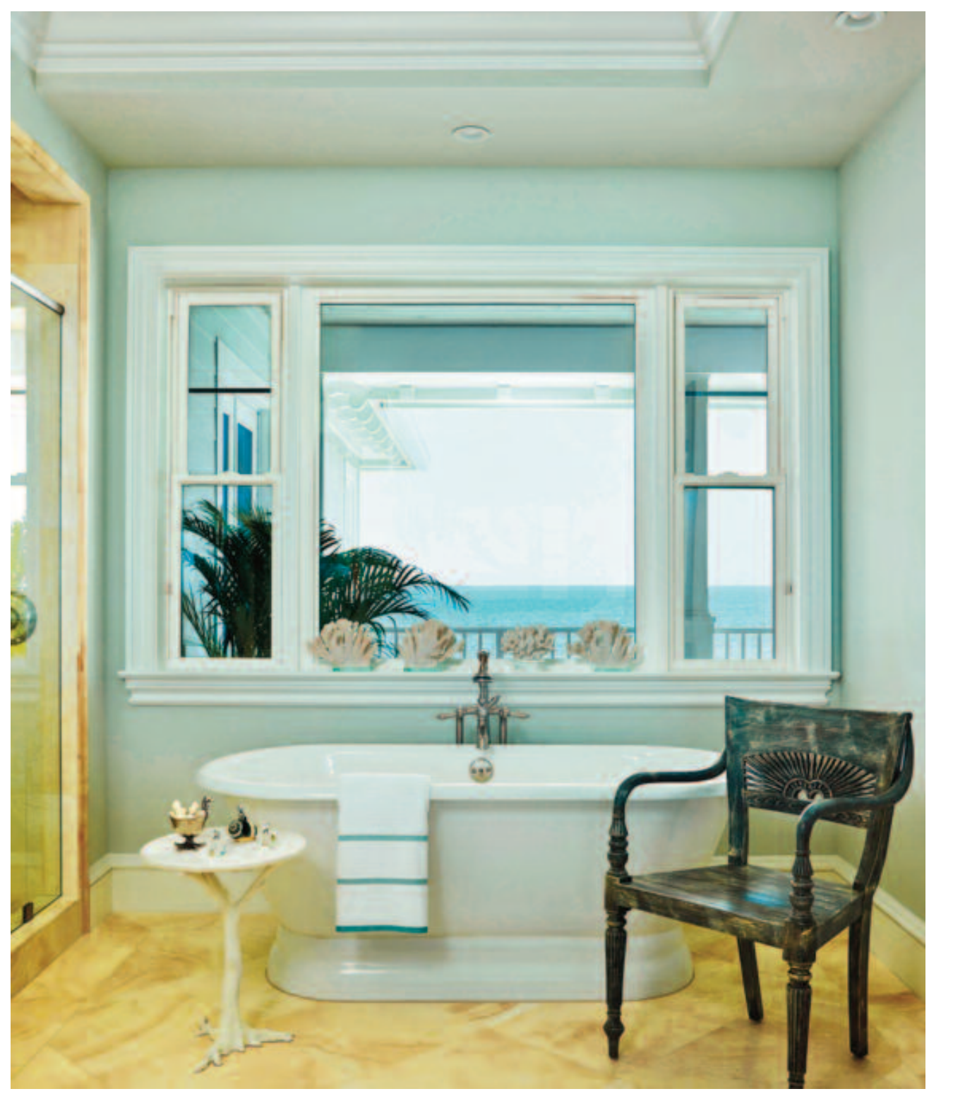
The tone-on-tone finishes were kept simple in the master bath, yet the walk-in shower and soaking tub provide immediate at-home luxury.

"We carefully limited the color palette to complement not only the art, but also the external environment."